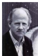
Best wishes to you all, John Ralston Saul

When you read it you will sense the frustration we all feel. The Chinese authorities do not need to damage their country's reputation in this way. There is no honour in employing 20 to 50,000 internet police or imprisoning 40 writers or provoking constant incidents with writers. The result is clear: the writing community is becoming increasingly determined to serve the public good.