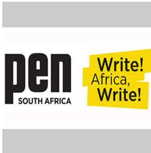
PEN SA Panel at ThinkFest!

PEN Afrikaans and PEN South Africa have made a joint submission commenting on the Copyright Amendment Bill, No 13 of 2017 as we are convinced that many of the changes to the Copyright Act, 98 of 1978 will have a direct and detrimental impact on South African authors, stripping authors of their rights and depriving them of opportunities for earning remuneration... read more