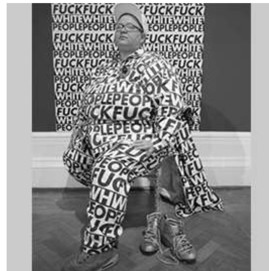
"'Fuck White People' Court